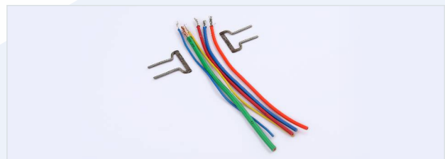
Heating elements for TWS-002